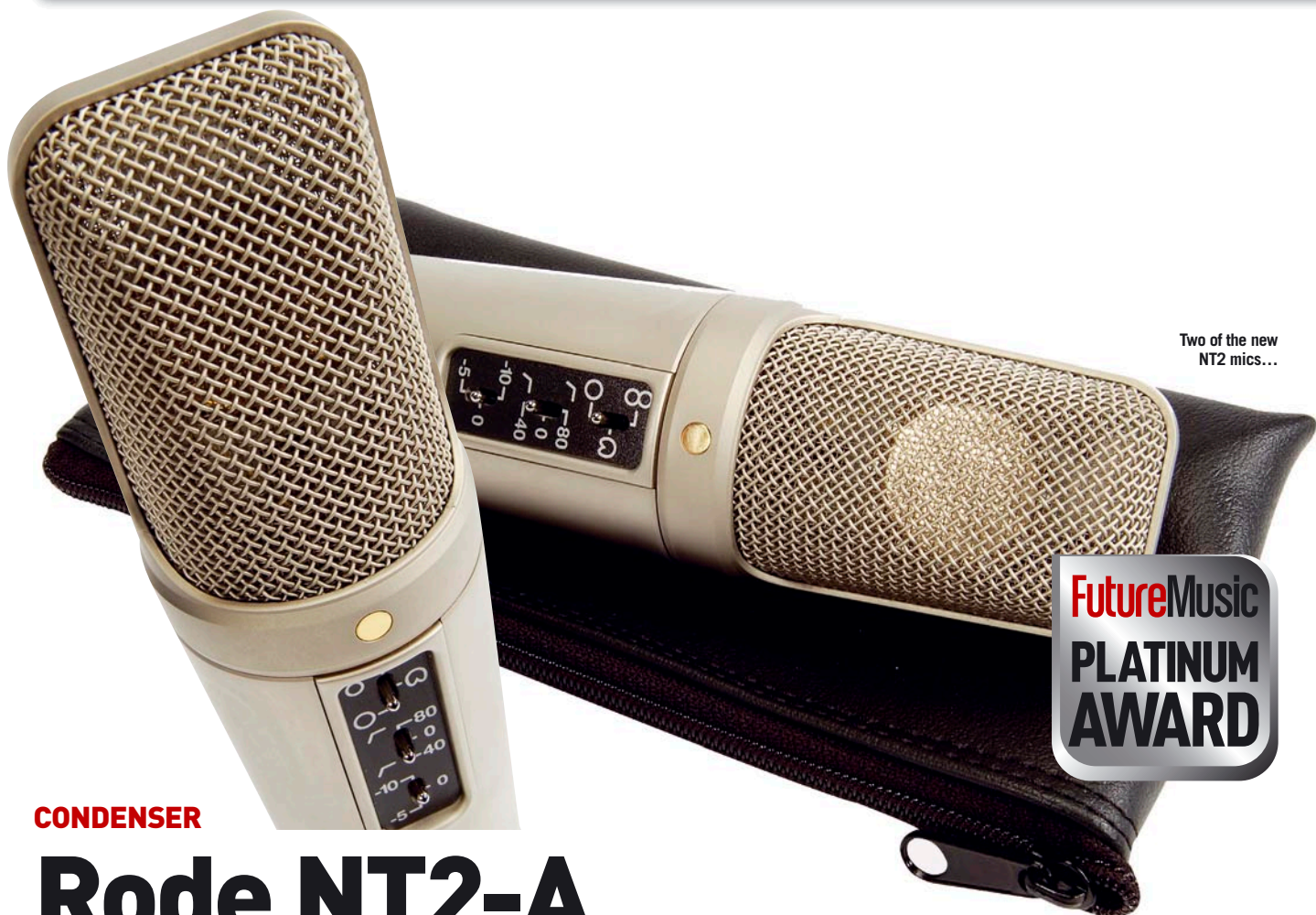
Two of the new NT2 mics...